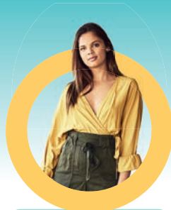
flexiFED 1 YOUNG SINGLES from R1 953