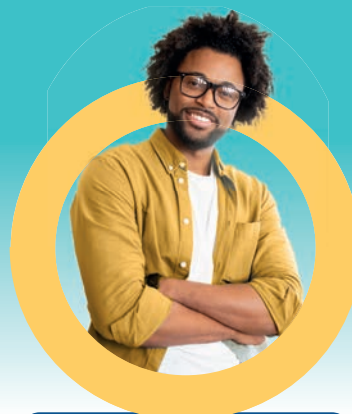
flexiFED 4 MATURE FAMILIES from R4 330