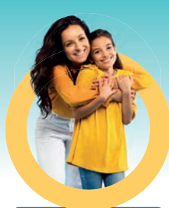
flexiFED 3 GROWING FAMILIES from R3 236